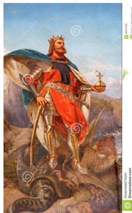
St. Olaf II

We are currently at 289 members, it would be exciting to reach 300 members by the end of 2019 – that's only 11 more members. So please, share with others the fun things, the benefits and opportunities that Sons of Norway has to offer! Let's accept that challenge and see what we can do!